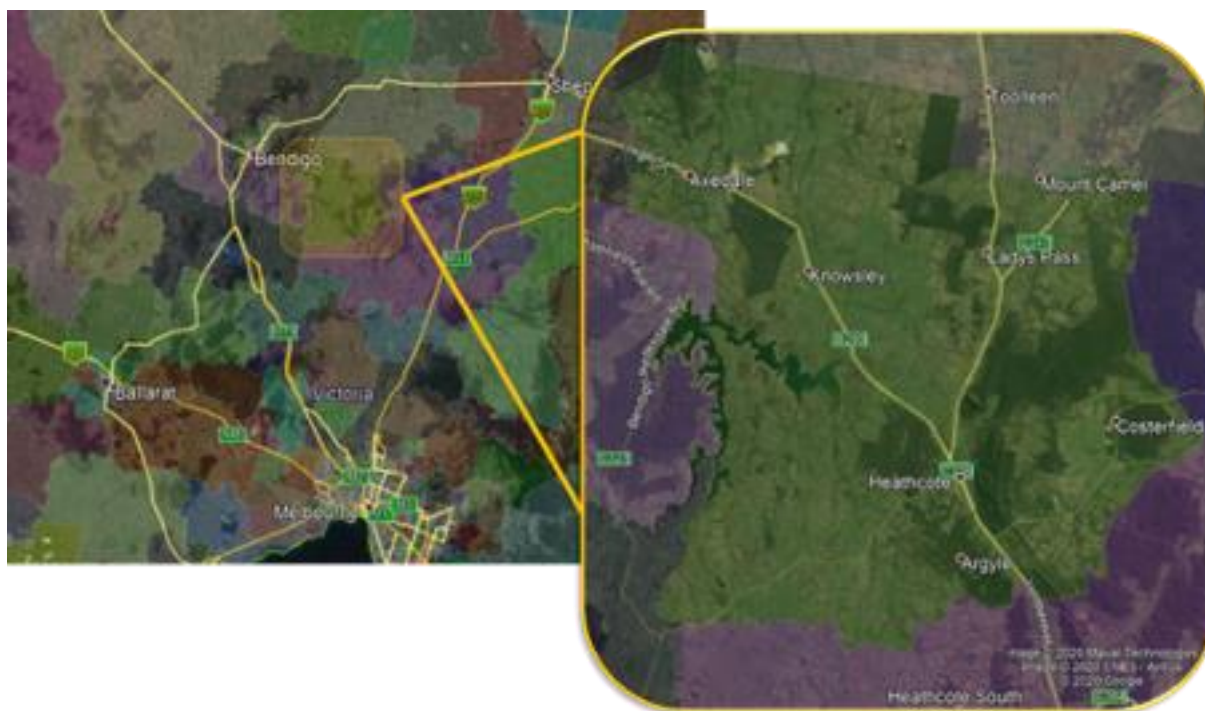
Figure 1 Map of the Heathcote SA2 region

The town of Heathcote and its surrounding district is located in the City of Greater Bendigo, with a population of about 2,793 people in the community or 4,529 including the broader Heathcote SA2 region 1 . Heathcote is located approximately 100 kilometres northwest of Melbourne and about 50 kilometres south east of Bendigo. The Rural Catchment of Heathcote adds a further 10 localities to the catchment.